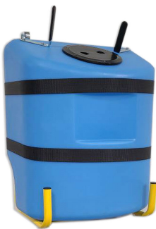
INJ-731 Tank & Frame only for extractor mounted water supplies