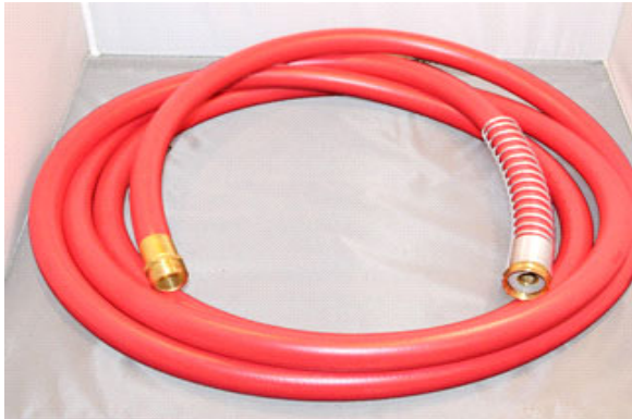
INJ-676 Heavy-duty red output hose with kink protector & brass fittings, 15'. HydroCart Max, serial number above 20111923