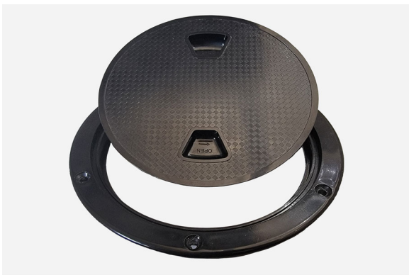
ACC-117 Replacement Cap & Rim for All Watering Carts (S/N above 2022-2386)