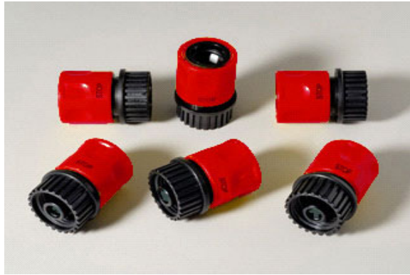
INJ-527 Quick-Connect FxF Thread (No Check Valve) (6 pack)