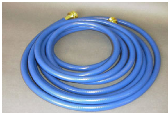
ACC-120 20' Blue Output Hose for Pump Controller II