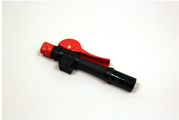
INJ-682 Instant Valve Pro, No Spinner