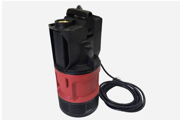
INJ-740 Replacement Pump (INJ MINI after Serial # 2025-0319)