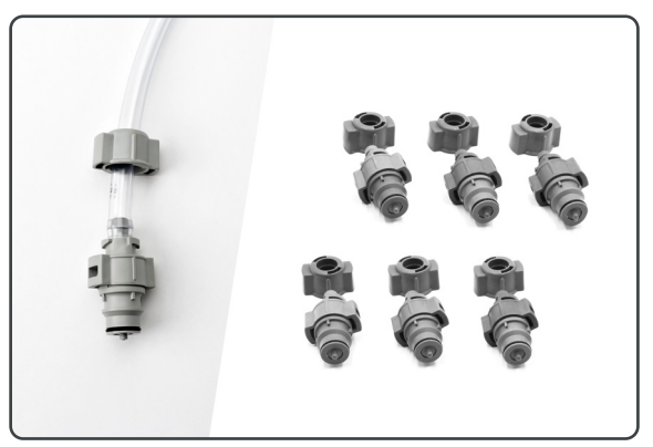
FLT-068 Twist-Lock Male Input Coupling for Stealth Watering System (6 Pack)