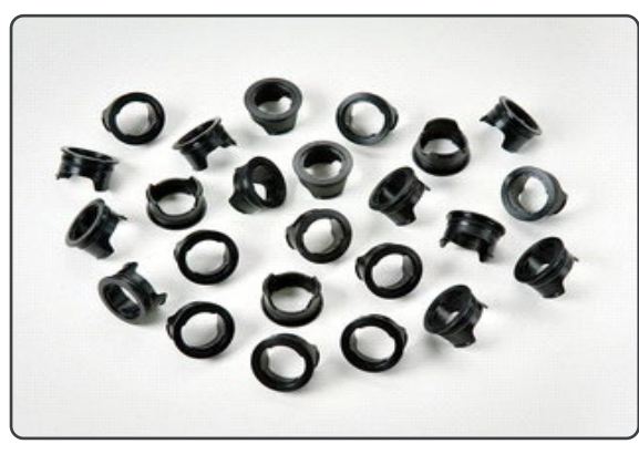
FLT-030 DIN Vent Adapter for Stealth Valves (24 Pack)