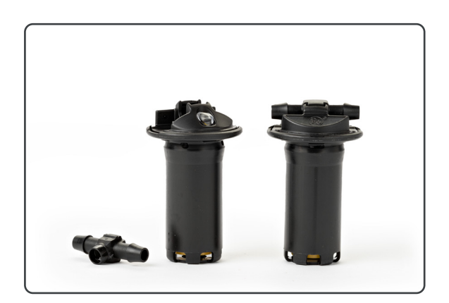
FLT-BL1 Stealth Valve, Single

Input Filter used in Stealth Barbed Input Assembly, with collars (6-Pack)