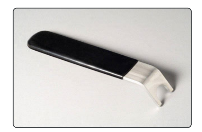
INJ-601 Collar Installation Tool

Black PVC Tubing for Stealth Watering System (100')