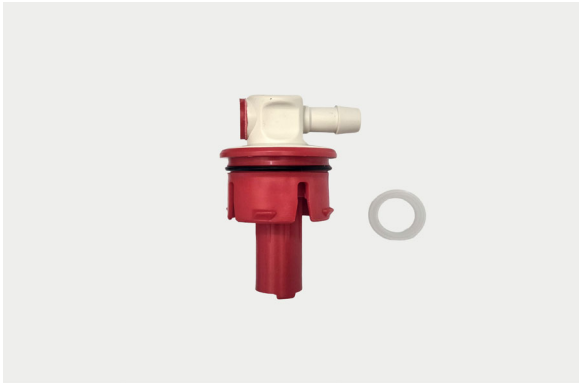
INJ-TL1D Terminating Water Injector, for DIN Vent Openings (Douglas)