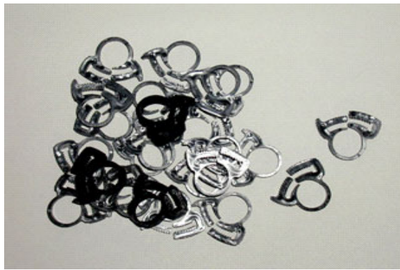
INJ-212 Ratchet Clamps (25 pack)