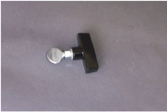
INJ-WR Quarter Turn Wrench