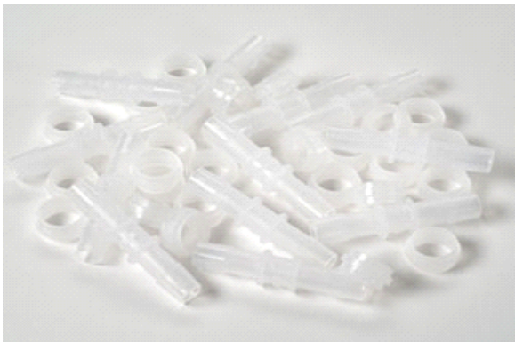
INJ-465 Repair Coupling with Collars (12 pack)