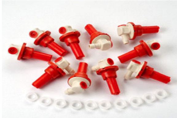
INJ-TL10 Terminating Injector, 10 pack, with collars