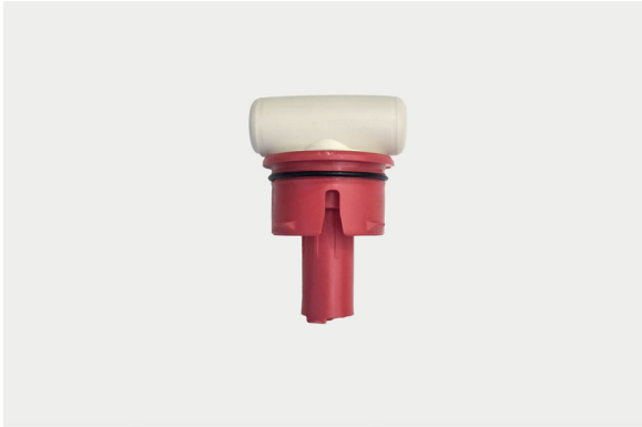
INJ-L1D Water Injector, for DIN Vent Openings (Douglas)