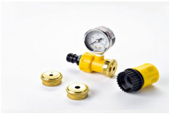
INJ-FC Flow Checker, for testing output pressure compatibility