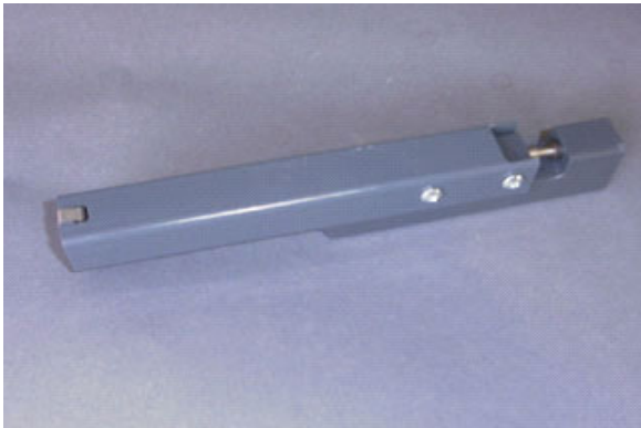
INJ-311 Injector Tubing Punch