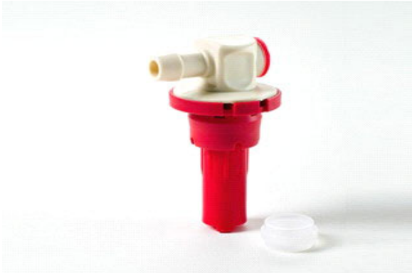
INJ-TL1 Terminating Water Injector, Push-Fit for 1/4-turn vent openings