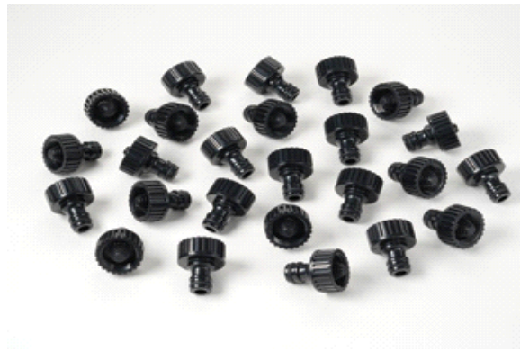
INJ-630 Quick-Connect MxF Thread with Check Valve (25 pack)