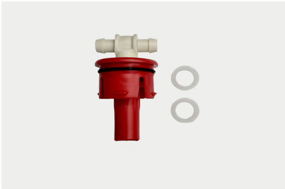
INJ-CL1D ClampLock Water Injector, for DIN Vent Openings (Douglas)