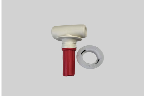
INJ-L1Y Water Injector, for raised boss 1/4-turn vent openings (EnerSys)