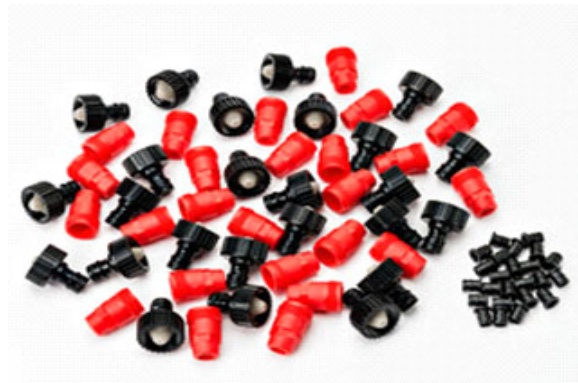
INJ-CP25 Quick-Connect Input Coupling for Water Injectors™ (25 pack)