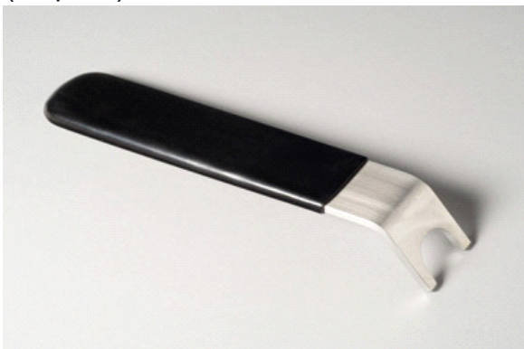
INJ-601 Collar Installation Tool