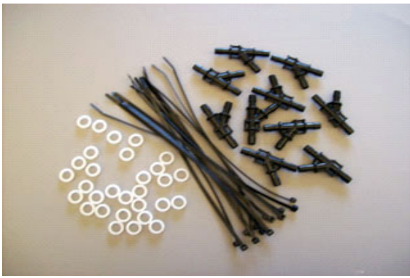
INJ-615 Wye Fitting with collars (10 Pack)