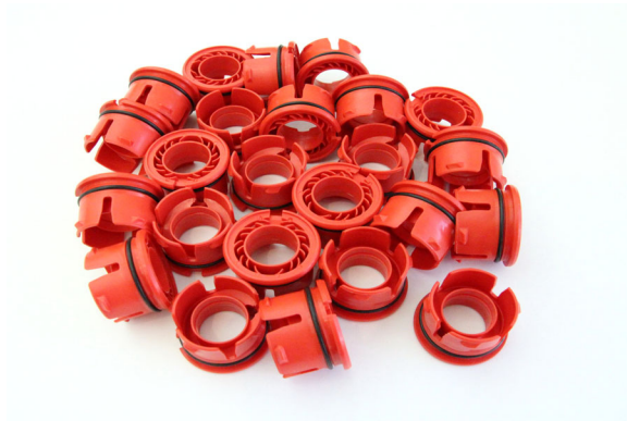
INJ-458 DIN Vent Adapter 24 pack