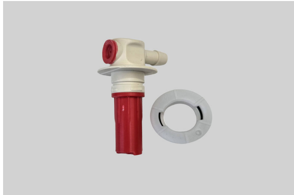
INJ-TL1Y Terminating Injector, for raised boss 1/4-turn vent openings (EnerSys)