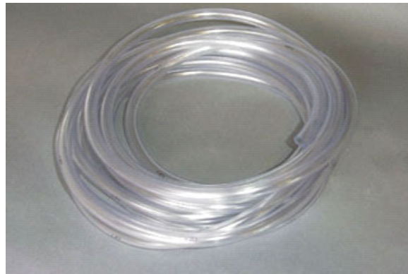
INJ-198 Tubing, 25 feet 1/2" OD