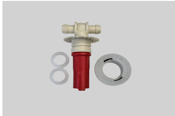
INJ-CL1Y Repair Injector, for raised boss 1/4-turn vent openings (EnerSys)