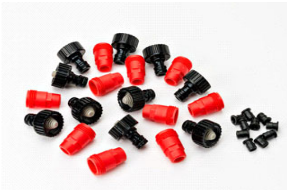
INJ-CP10 Quick-Connect Input Coupling for Water Injectors™ (10 pack)