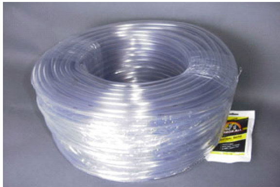
INJ-495 Injector Tubing, 500 feet, 1/2" OD