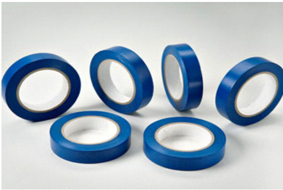
INJ-202 Tape, installation, 36 yd, (6 pack)