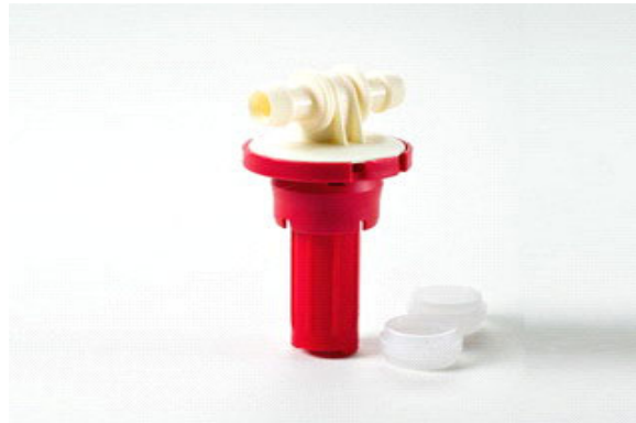
INJ-CL1 ClampLock Water Injector, Push-Fit for 1/4 turn vent openings