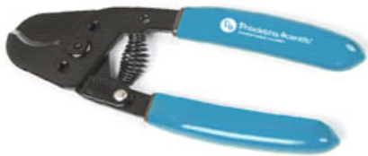
FLT-093 Tubing Cutter for Speed Tubing (Water Inector Spider & Stealth Watering Systems)