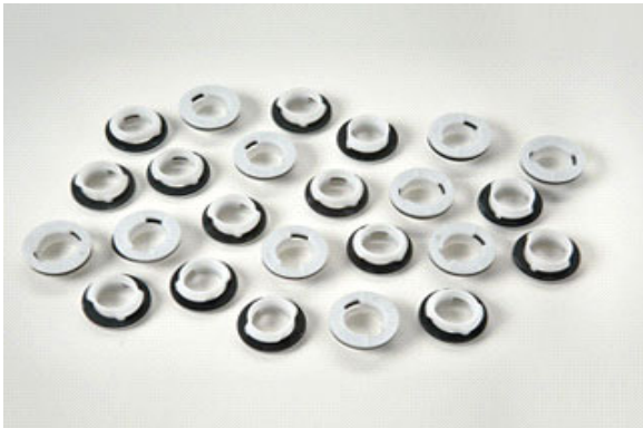
INJ-656 Quarter turn vent adapter (24 pack)