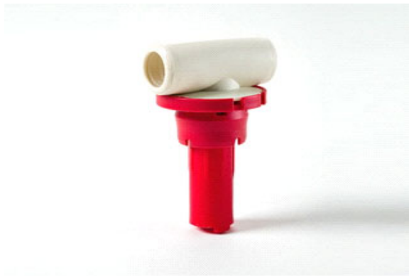
INJ-L1 Water Injector, Push-Fit for 1/4 turn vent openings