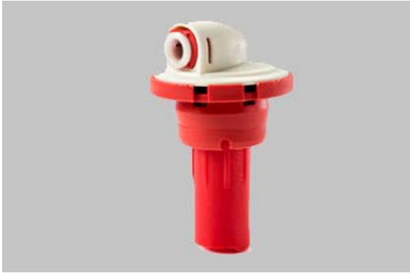
INJ-LP1 Injector Spider, Loose