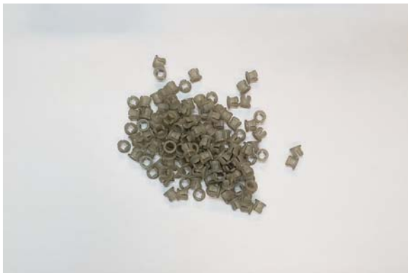
ACC-071 Grippers, Stealth Water Injector Spider, 100pk