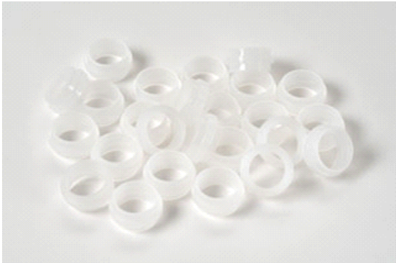
INJ-608 Collars for Water Injectors & Stealth Systems (25 Pack)