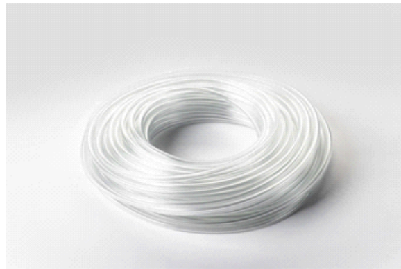
FLT-072 1/4" OD Tubing for Push-fit grippers for Stealth & Spider Systems