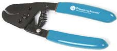
FLT-093 Tubing Cutter for Speed Tubing (Water Injector Spider & Stealth Watering Systems)