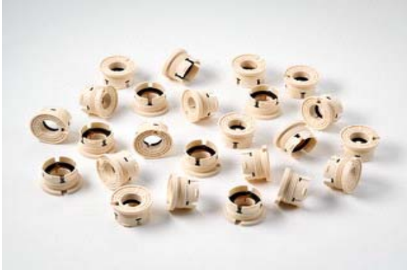
INJ-458 DIN Vent Adapter 24 pack