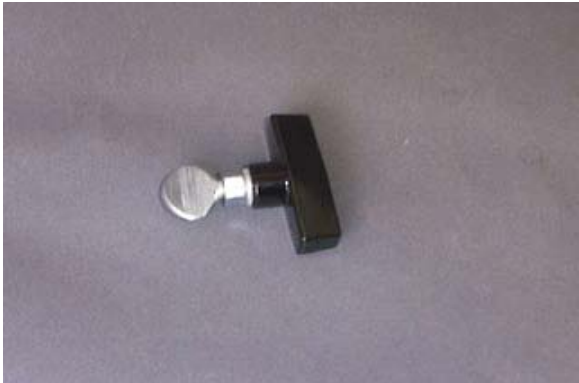
INJ-WR Quarter Turn Wrench