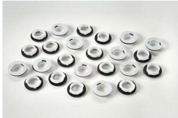
INJ-656 Quarter turn vent adapter (24 pack)