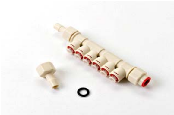
INJ-670 6 Port Inline Manifold for Injector Spider Systems