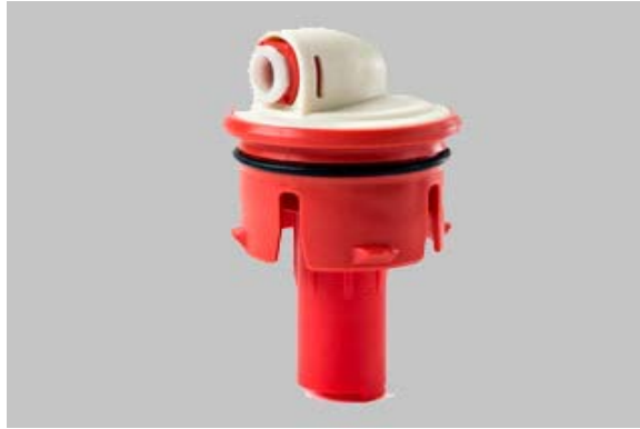
INJ-LP1D Water Injector Spider, for DIN Vent Openings