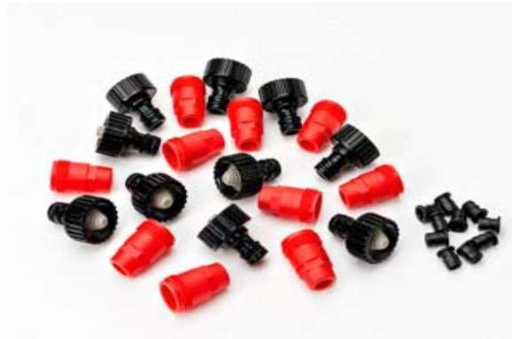
INJ-CP10 Quick-Connect Input Coupling for Water Injectors™ (10 pack)