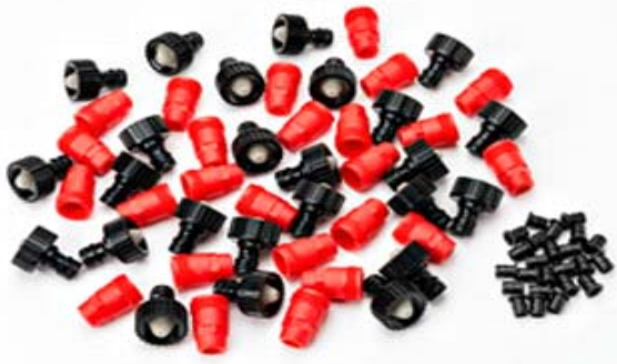
INJ-CP25 Quick-Connect Input Coupling for Water Injectors™ (25 pack)