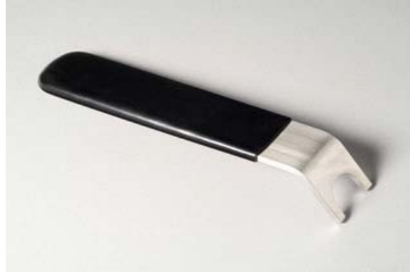
INJ-601 Collar Installation Tool