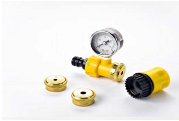
INJ-FC Flow Checker, for testing output pressure compatibility