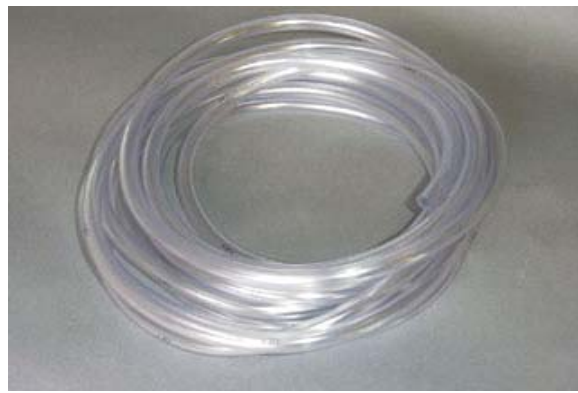
INJ-198 Tubing, 25 feet 1/2" OD