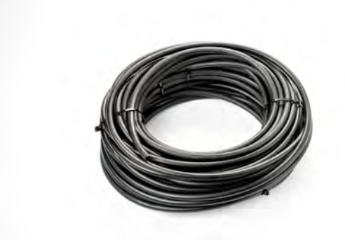
FLT-108 Tubing, 100', Black PVC Tubing, Barbed Stealth