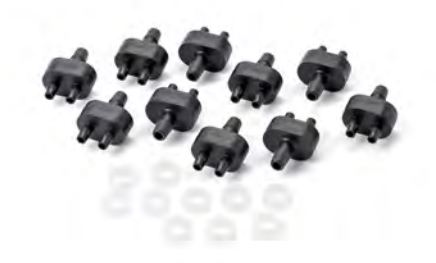
FLT-104 Input Filter used in Stealth Barbed Input Assembly, with collars (6 pack)