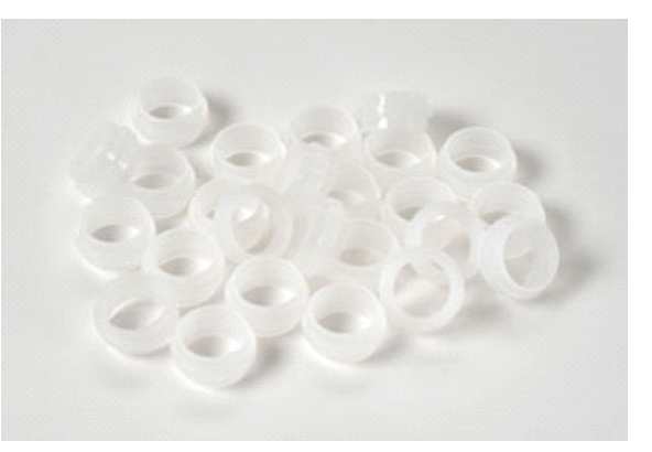
INJ-608 Collars for Water Injectors & Stealth Systems (25 Pack)