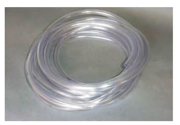
INJ-198 Tubing, 25 feet 1/2" OD