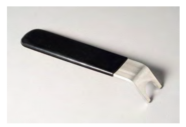
INJ-601 Collar Installation Tool