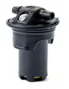
FLT-BLD1 Stealth Barbed Valve, Single, with DIN Adapter