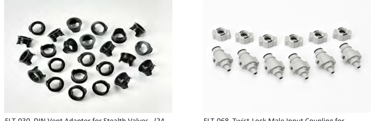
FLT-030 DIN Vent Adapter for Stealth Valves, (24 pack)