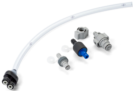
FLT-004U Universal Input Coupling and Filter Assembly for Stealth Watering System (includes Stealth, Flow-rite and BFS/BWT CPC couplings)