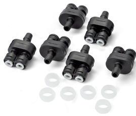
FLT-020 Replacement Input Filter used in Input Filter Assembly, with collars (6 pack of filters)