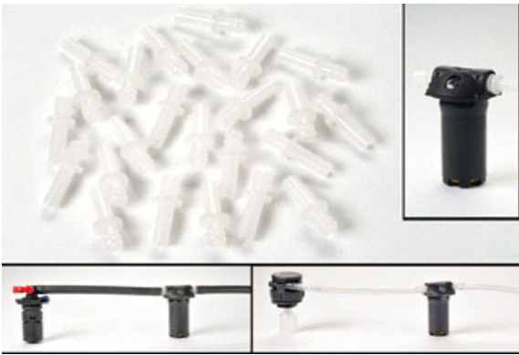
FLT-064 Barbed Fitting Adapter for Stealth Float Valves, 24 pack