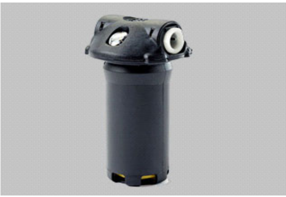
FLT-L1 Stealth Float Valve, Loose