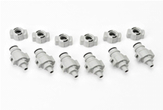
FLT-068 Twist-Lock Male Input Coupling for Stealth Watering Systems (6 pack)