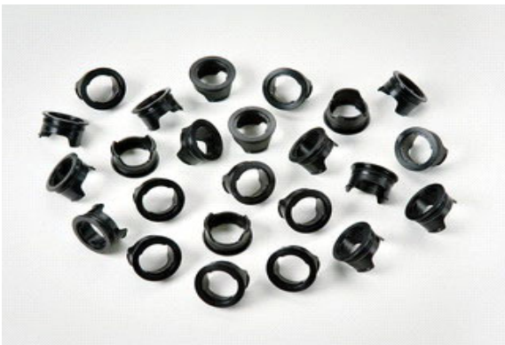
FLT-030 DIN Vent Adapter for Stealth Valves, (24 pack)