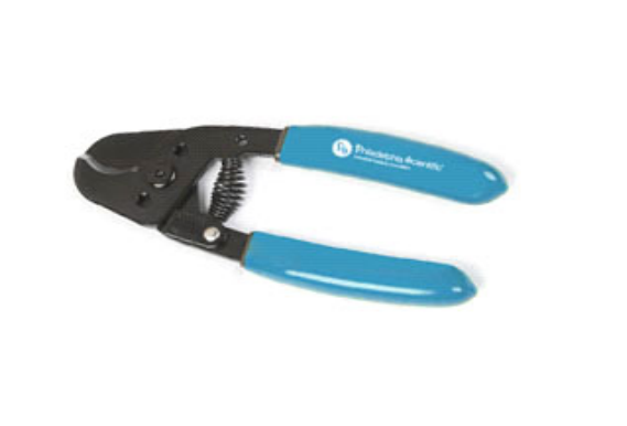
FLT-093 Tubing Cutter for Speed Tubing (Water Injector Spider & Stealth Watering Systems)