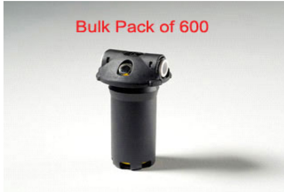
FLT-026 Stealth Float Valve - Bulk Pack of 600 Stealth Valves