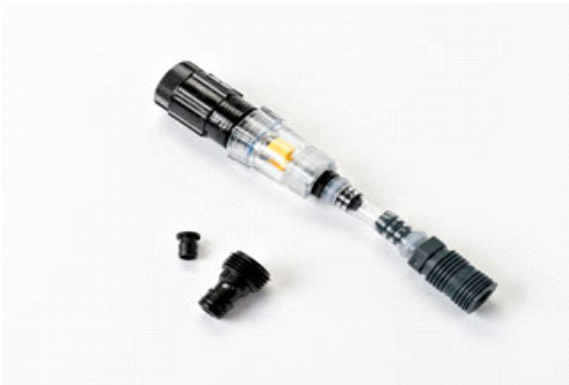
FLT-070A Adapter for Stealth Watering Systems to Injector Water Supplies and HydroPure Deionizers (BFS™ compatible)