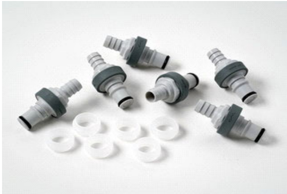
FLT-024E Replacement Male Input Coupling for BFS compatible Stealth Watering System (Blue CPC Couplings) (6 Pack)