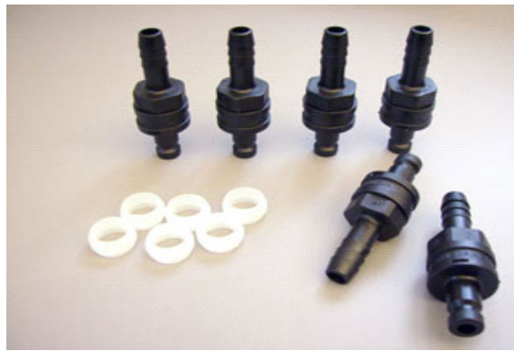
FLT-024A Replacement Male Input Coupling for BFS compatible Stealth Watering System (6 Pack)