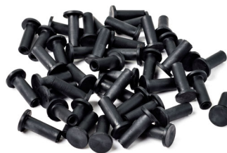
FLT-029 End Plug, Stealth Watering System - 50 pack