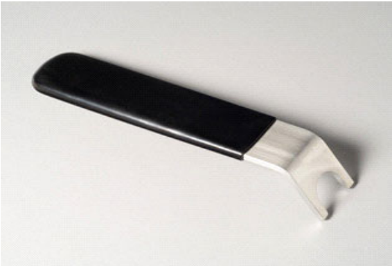
INJ-601 Collar Installation Tool