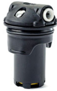
FLT-LD1 Stealth Float Valve, Loose, with Din Adapter