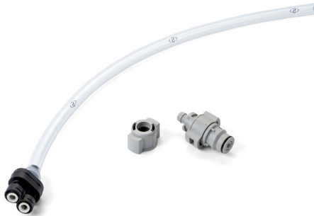
FLT-027 10 pack Standard Input Coupling and Filter Assembly for Stealth Watering System