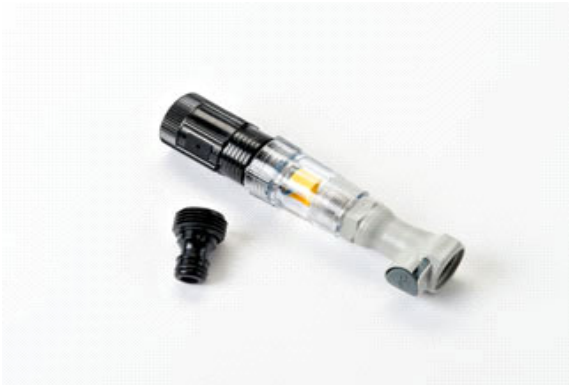
FLT-070 Adapter for Stealth Watering Systems to Injector Water Supplies and HydroPure Deionizers