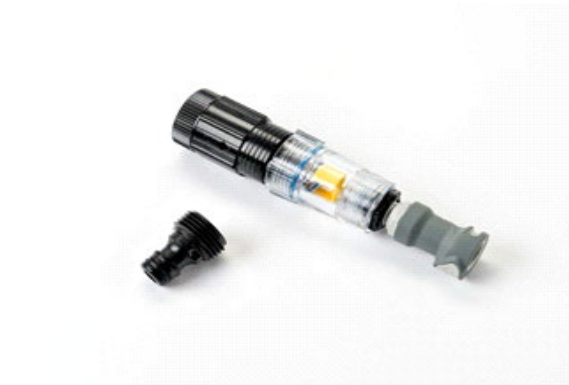
FLT-070E Adapter for Stealth Watering Systems to Injector Water Supplies and HydroPure Deionizers (BWT™ compatible)