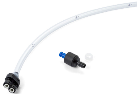
FLT-027A 10 pack BFS™ Input Coupling and Filter Assembly for Stealth Watering System