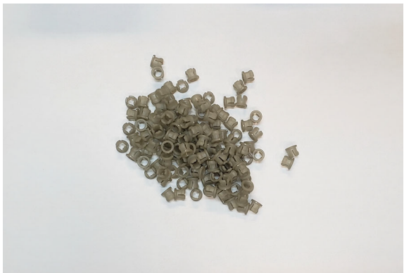
ACC-071 Grippers, Stealth Water Injector Spider, 100pk