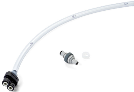
FLT-027E 10 pack BFS™ Input Coupling and Filter Assembly for Stealth Watering System (Blue CPC Couplings)