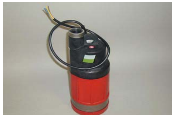
INJ-540 Replacement Pump for Injector Water Supplies