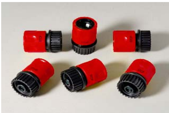
INJ-527 Quick-Connect FxF Thread (No Check Valve) (6 pack)