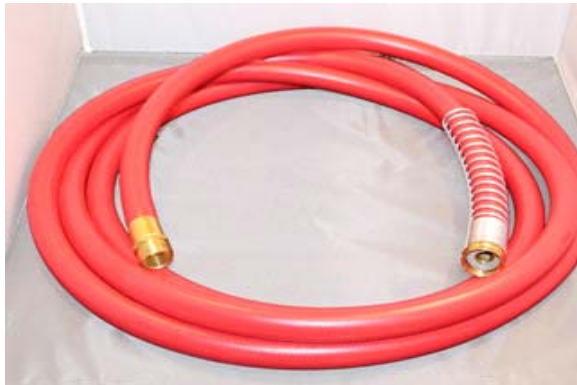
INJ-676 Heavy-duty red output hose with kink protector & brass fittings, 15'. HydroCart Max, serial number above 20111923