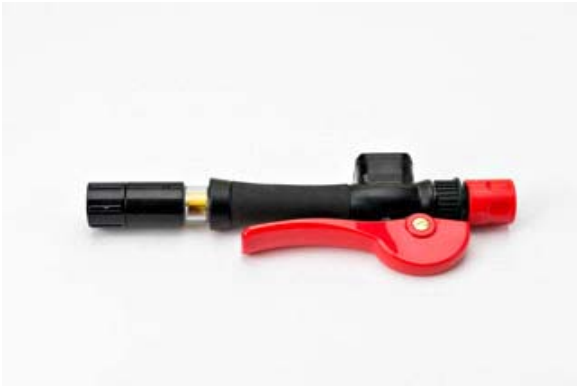
INJ-607 Instant Valve PRO