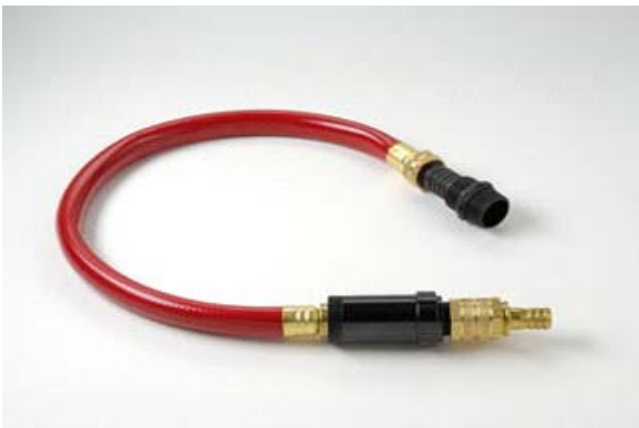
INJ-645 Inline Regulator Assembly (for use inside the tank)