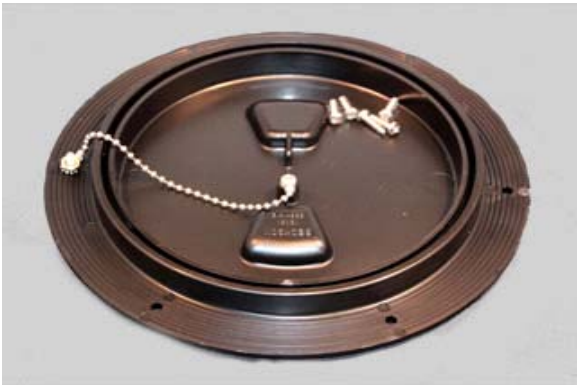
INJ-674 Replacement Cap, Chain and Rim