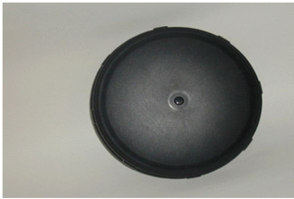
INJ-562 Tank Cap, INJ-HCT serial number below 20111959