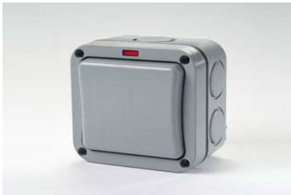
INJ-672 Switch, HydroCart Max (serial number 20111959 and higher)